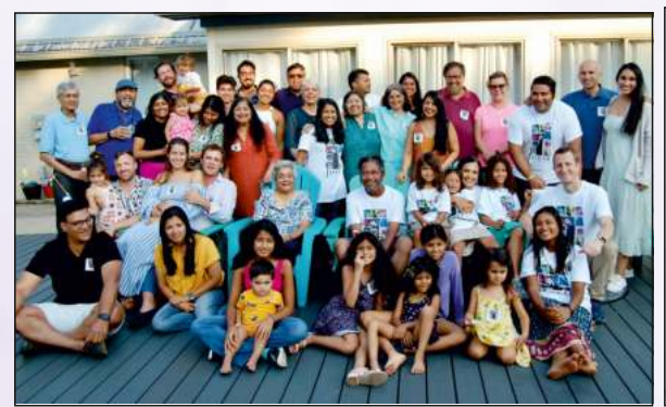
The DIOTRIX Clan - Annual Gathering -August, 2023 - West Virginia, USA -" The family that Sings Together, Clings Together." - one of Dad's favorite sayings

Our parents were truly extraordinary people. Our mother's whole life was one of selfless devotion. Besides doing everything possible to keep us kids happy and healthy, Mom went out of her way to make others also feel like part of the family. Scores of people even today, reminisce about the genuine warmth and hospitality of our mother, and the haven that was Devadan.