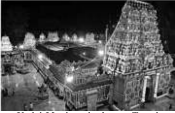
Kadri Manjunatheshwara Temple

Manjunatheshwara at Kadri, made divine, sharp in contrast in styles of structure, with several other places of worship like the Chapel of St. Aloysius at Light House Hill, the Church of the Lady of Miracles, Milagres at Hampankatta or the Juma Masjid at