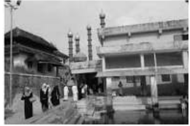
Zeenath Baksh Masjid, Bunder

If someone asks me, where would I like to live if I have a rebirth and what would I like to do, I have no doubt about my answer. Undoubtedly, I don't believe in rebirth; all the same, if I am born again, I would like to live in Mangaluru and be with the people of Mangaluru. I don't want to be born in Mangaluru because I would not then be in a situation to be introduced to the qualities and values of the place, be surprised and delighted. Hence, I want to be born elsewhere and come to stay in Mangaluru and discover its greatness. As far as answering what I would do in my next birth, the answer is honestly simple. I would like to be a teacher again, may be, with a difference that it should be at a primary school in Mangaluru.