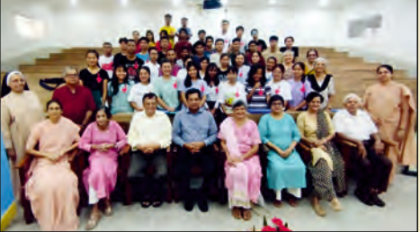
Students with CASK members & sisters of St Agnes